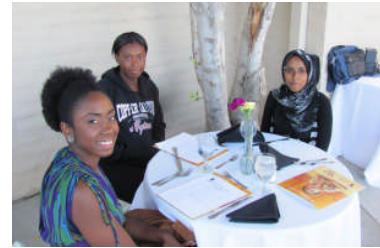
Students from Tempe High School

This Career Cluster also taught the students the importance of “Giving Back” in their community. Students collected approximately 155 can goods and collected approximately $150 for the YMCA Strong Kids Campaign.