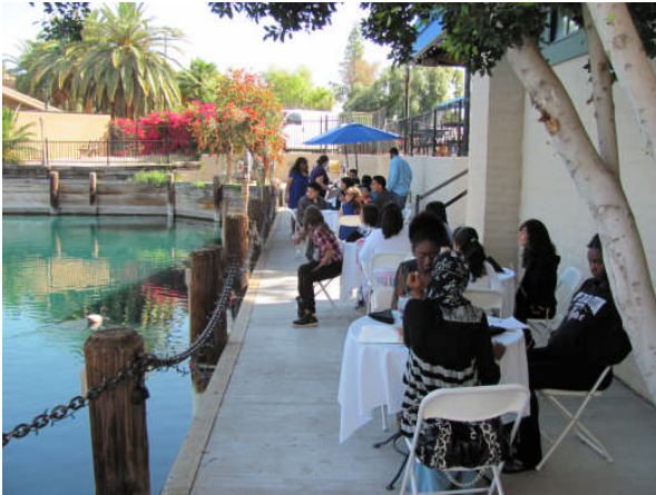
Students Participating in Dining Etiquette Career Cluster